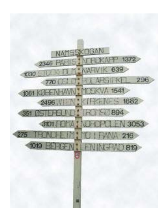
Let's be realistic here...

Not all PLR membership sites are created equally – some of their content is just BAD, while others are produced with premium quality!